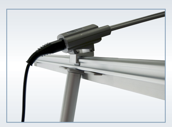
Attach the spotlight on the top profile.