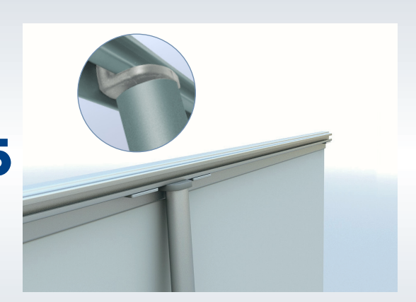
Attach the top profile to the top fastener of the supporting rod.