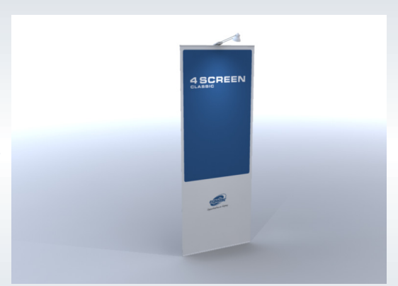
Place the system at the desired location and verify that the system is stable.