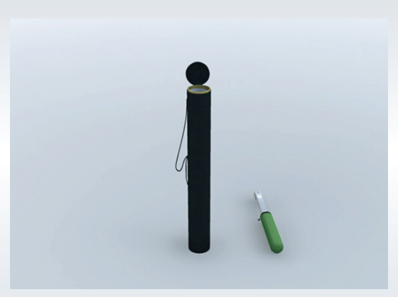
Take out the graphic panel, foot and supporting rod from the bag.