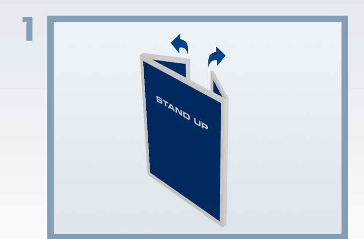
Take the frame out of the bag and unfold it.